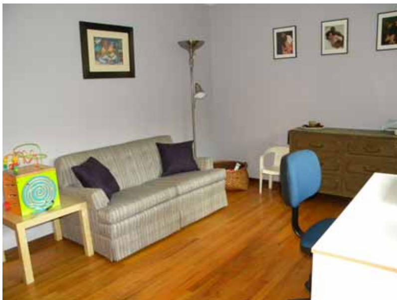
Birthingway's Breastfeeding Clinic